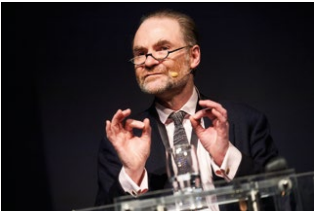
Timothy Garton Ash

Speaker: Timothy Garton Ash , Professor, Oxford University